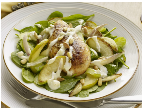
Blue Cheese Chicken