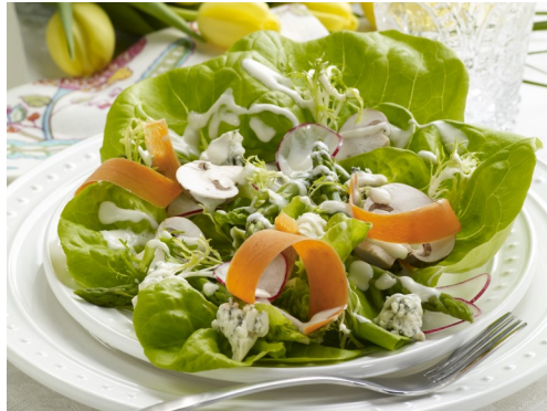
Blue Cheese Spring Salad

Visit our Recipe & Inspiration Section on MarzettiFoodservice.com for recipe details!