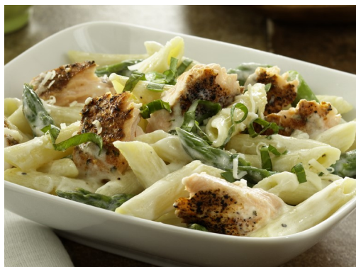
Blackened Salmon with Asiago Penne