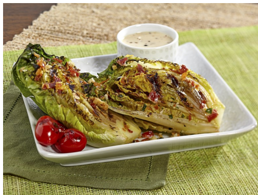
Grilled Caesar Salad with Pancetta & Grilled Tomatoes