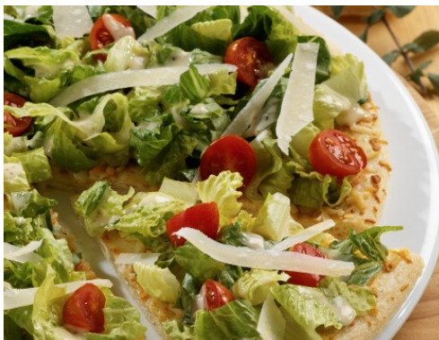
Parmesan Crust Caesar Pizza

Visit our Recipe & Inspiration Section on MarzettiFoodservice.com for recipe details!