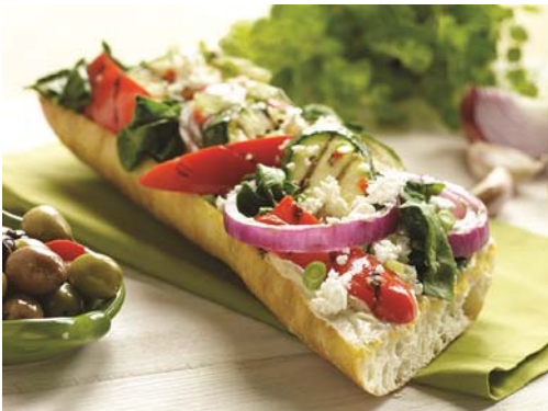
Grilled Vegetable and Cheese Sandwich