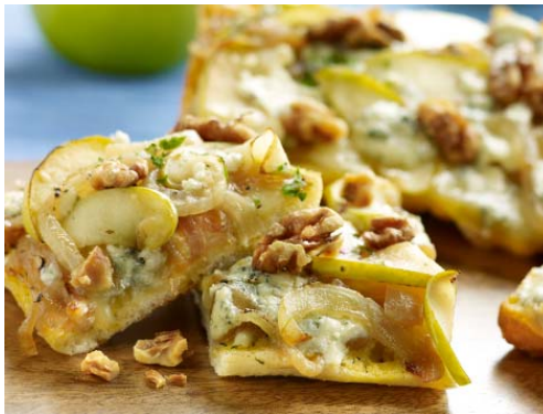
Apple Onion Pizza

Visit our Recipe & Inspiration Section on MarzettiFoodservice.com for recipe details!