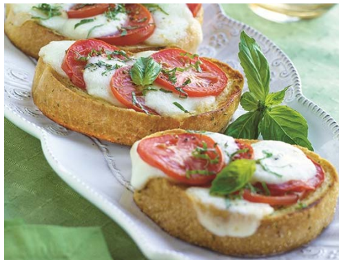
Tomato, Basil & Mozzarella Crostini

Visit our Recipe & Inspiration Section on MarzettiFoodservice.com for recipe details!