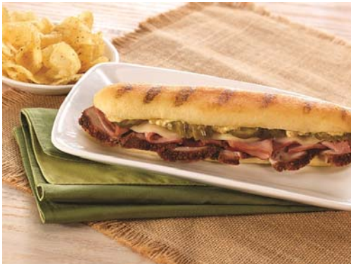
Cuban Panini Breadstick Sandwich

Visit our Recipe & Inspiration Section on MarzettiFoodservice.com for recipe details!